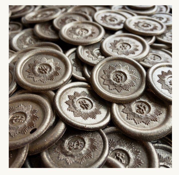
Custom chocolate "wax" seals Set up charge of $55 Only available in metallic colors Lead time 2-3 weeks