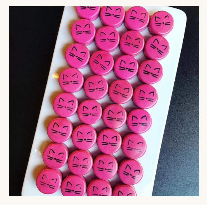
Custom bonbon stencils - no charge Basic single line designs Single letter monograms Designs on a case by case basis