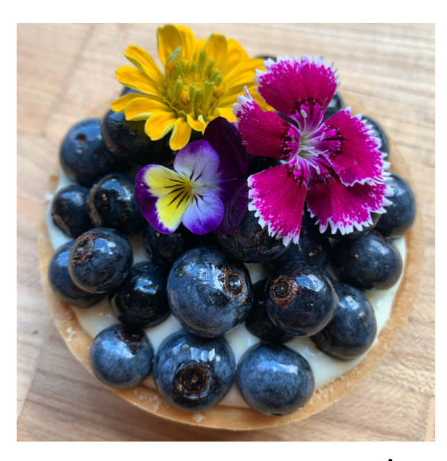
Fruit Tarts (Large - 3.3") - $7 Fruit Tarts (Mini - 2.1") - $5