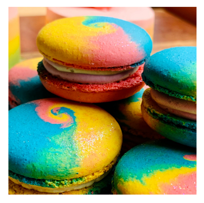
Macarons -$3.25 Assorted flavors & designs