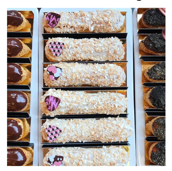
Eclairs (4.5") - $5 Mini Eclairs (3") - $3 Assorted flavors & designs