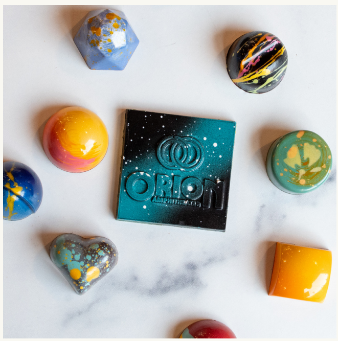
Custom Logo Chocolate Bar Several sizes to chose from 3-4 week lead time