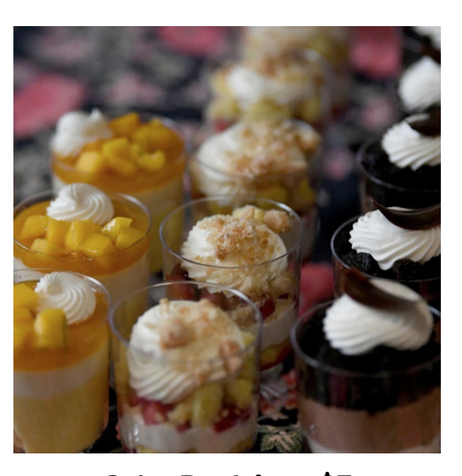
Cake Parfaits - $7 Assorted flavors